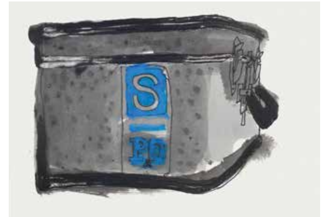
Mum's , 2026, watercolour and Indian ink on paper, 126 x 177mm

The smaller canvas, cut to shape, is an edge-to-edge pattern of 'the old school tie', a staggered geometry of school insignia and house colours, of belonging and social standing and traditional allegiance devoid of neck or head or school identity.