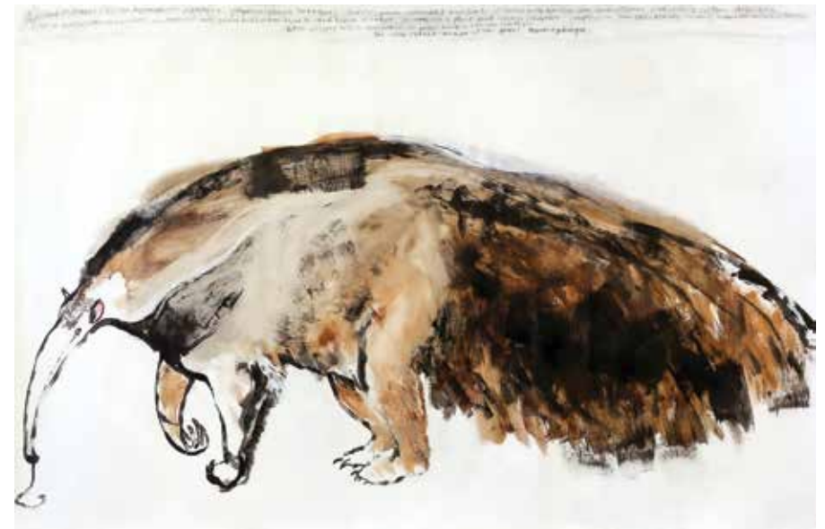
Above: Giant South American Anteater , 2026, acrylic, watercolour, charcoal and pencil on paper; 995 x 1510mm Left: Red Howler in Casigua (with Rousseau) , 2026 (detail) acrylic and oil stick on loose canvas

In contrast to this languid scene, the two canvases of Venezuelan oil wells in (Lake Maracaibo) Bolívar Wept/Bolívar Lloró , present a hard, hot, burning world devoid of plant or animal. Oil rigs march across the reddened landscape, their stark geometry overlaid on to rough sheets of torn paper. Against the scorched sky, below a small