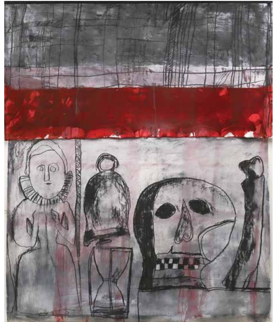
Above: The Reiver's Wedding , 2025, acrylic and charcoal on loose canvas, 1245 x 1015mm

Maracaibo, the centre of Venezuela's oil industry, rippled with tension. The history of white conquistadors, still vivid in minds of the Indigenous peoples; the run of military dictatorships; the poverty; the sickness (her mother nearly died from serum hepatitis); the proximity to dangerous animals (as children, they unwittingly played near rattlesnakes).