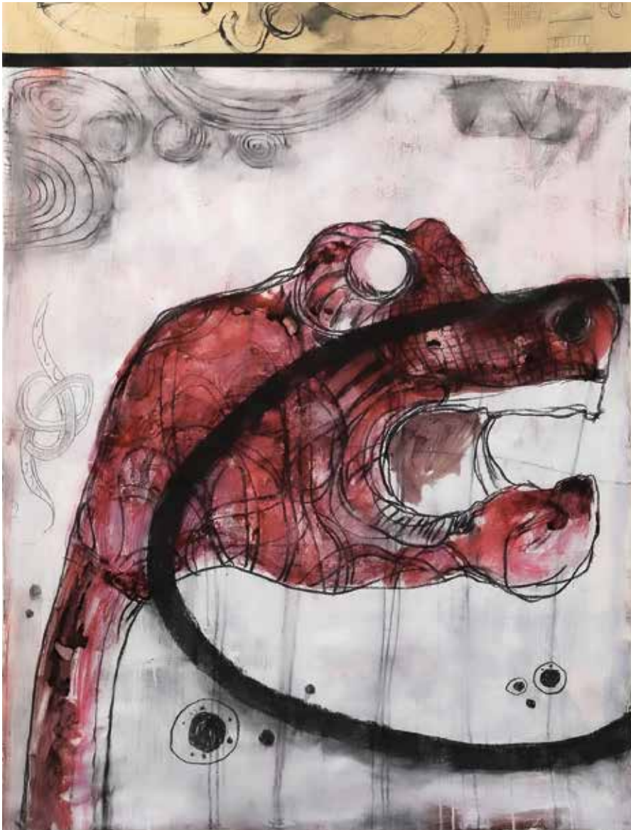
Border Diaspora , 2025, acrylic, charcoal and pencil on canvas, 1365 x 995mm

Their legacy remains in the stone towers dotting the landscape,